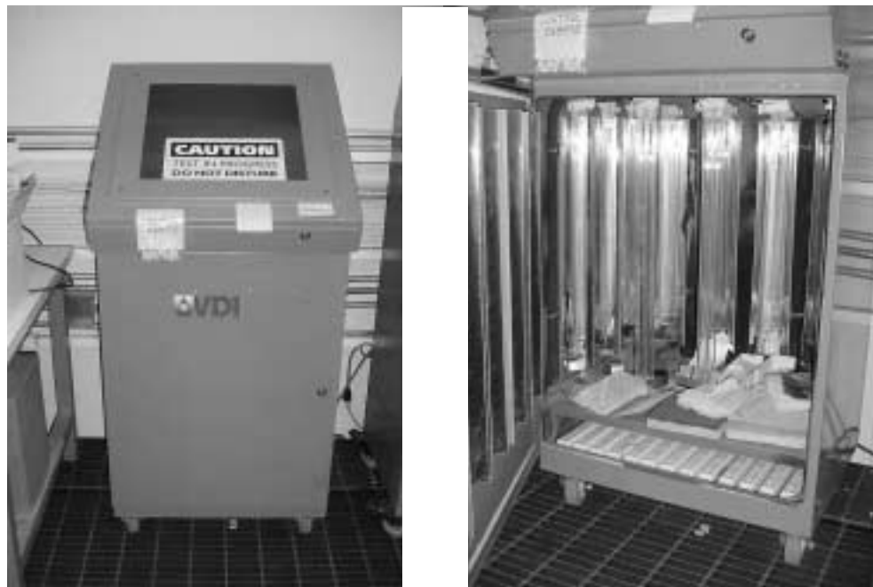
Figure 1 – Ultraviolet Exposure Test Chamber

Testing was conducted in a chamber designed specifically for evaluating the effect of UVC exposure on various materials. Twelve 55-watt UVC lamps power the interior of the test chamber, shown below in Figure 1. The high UVC output of the lamps, the reflectivity