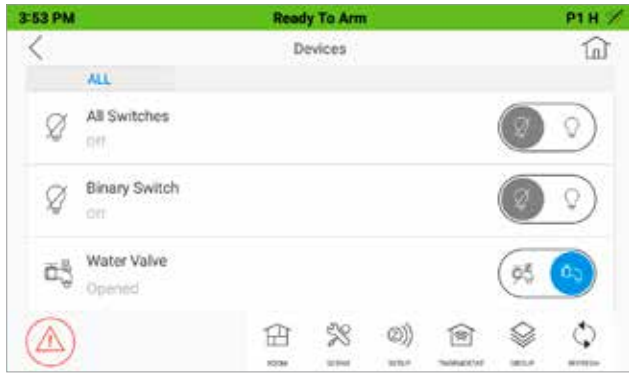
Z-Wave® List Screen