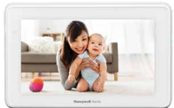
The home screen can display a digital picture frame featuring end-user's photos and video. Alternatively, it can display custom dealer branding images.