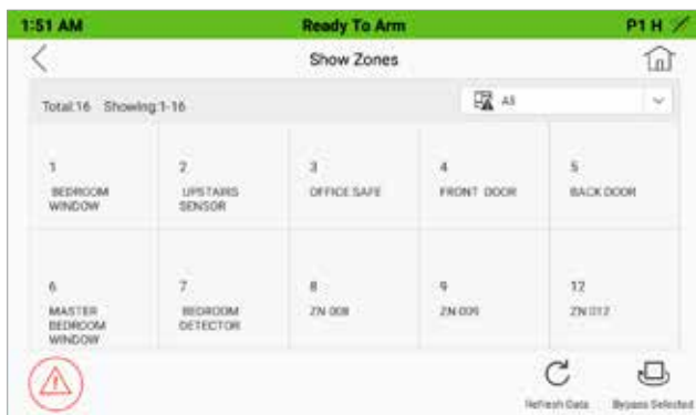
Zone List Screen