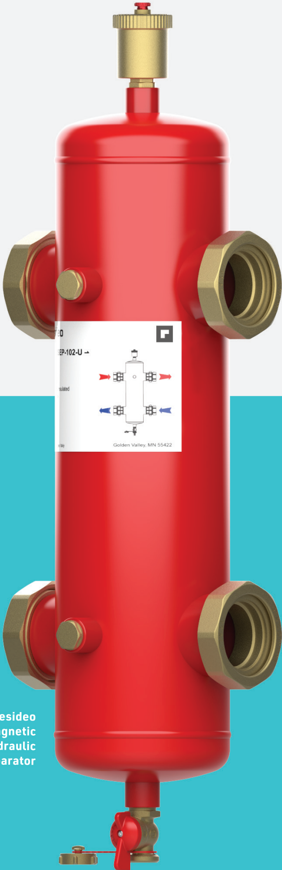
Resideo Magnetic Hydraulic Separator

The new Resideo Magnetic Hydraulic Separator protects modern hydronic installs through air, debris and ferrous removal, plus critical flow management between connected hydraulic circuits. Now it's easier for you to create a balanced hydronic system that delivers the comfort and efficiency customers want while minimizing callbacks.